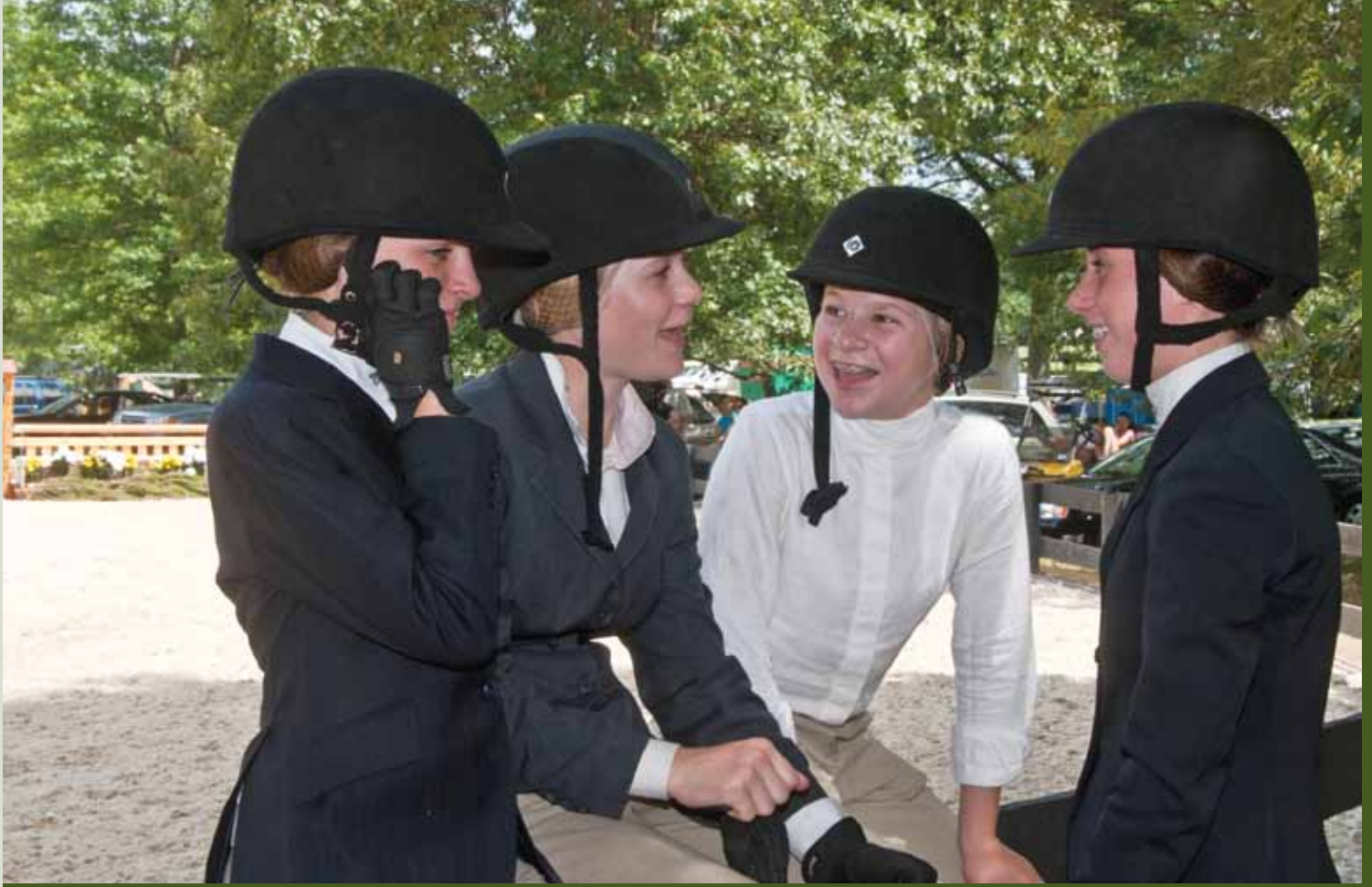
Blue Ribbon Sponsorship