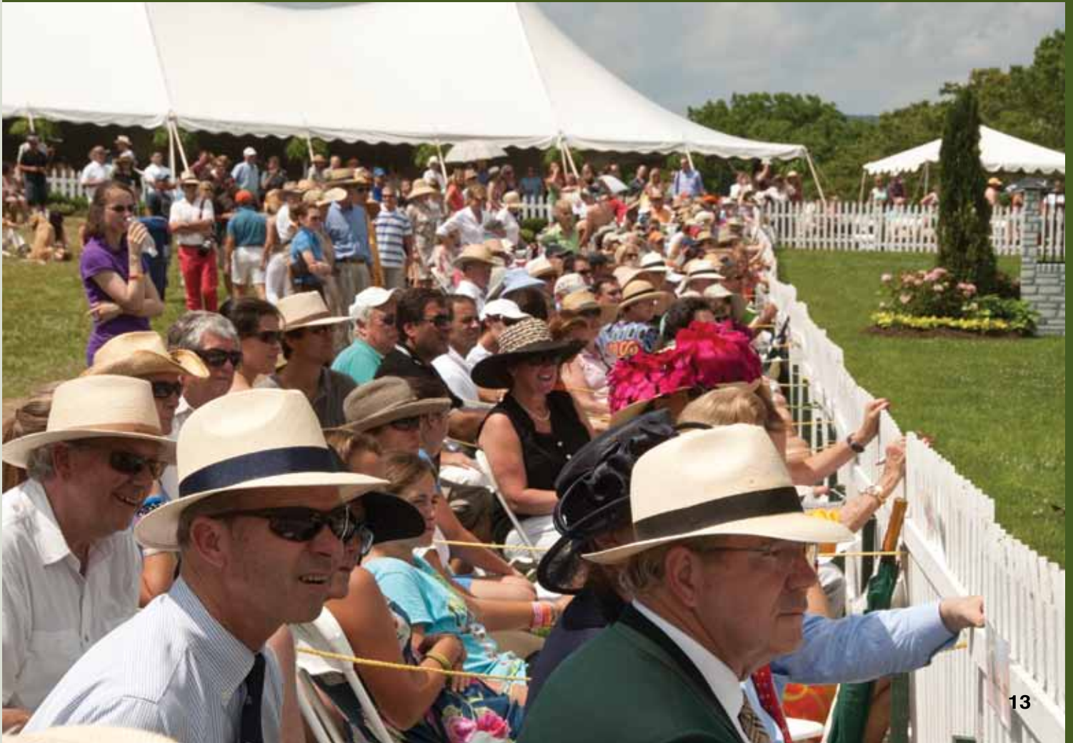
Grand Prix Jump Sponsorship