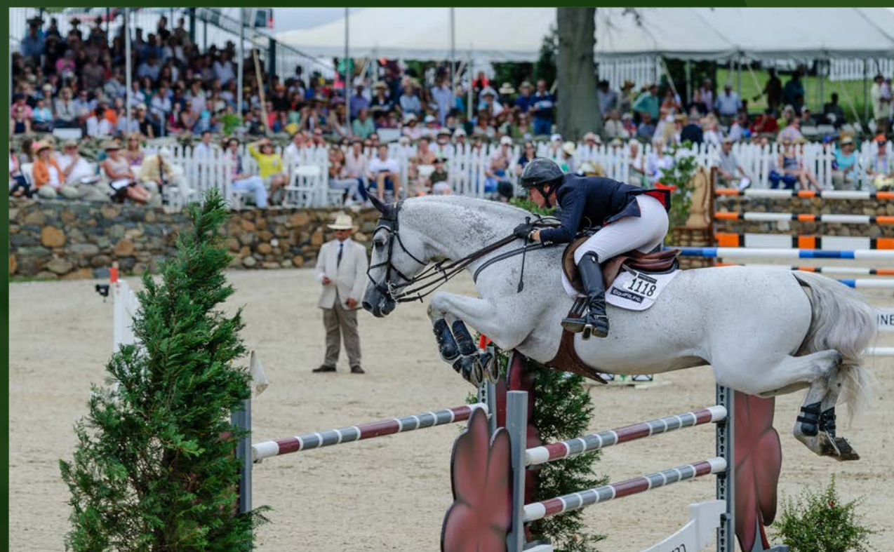
INTERNATIONAL GRAND PRIX