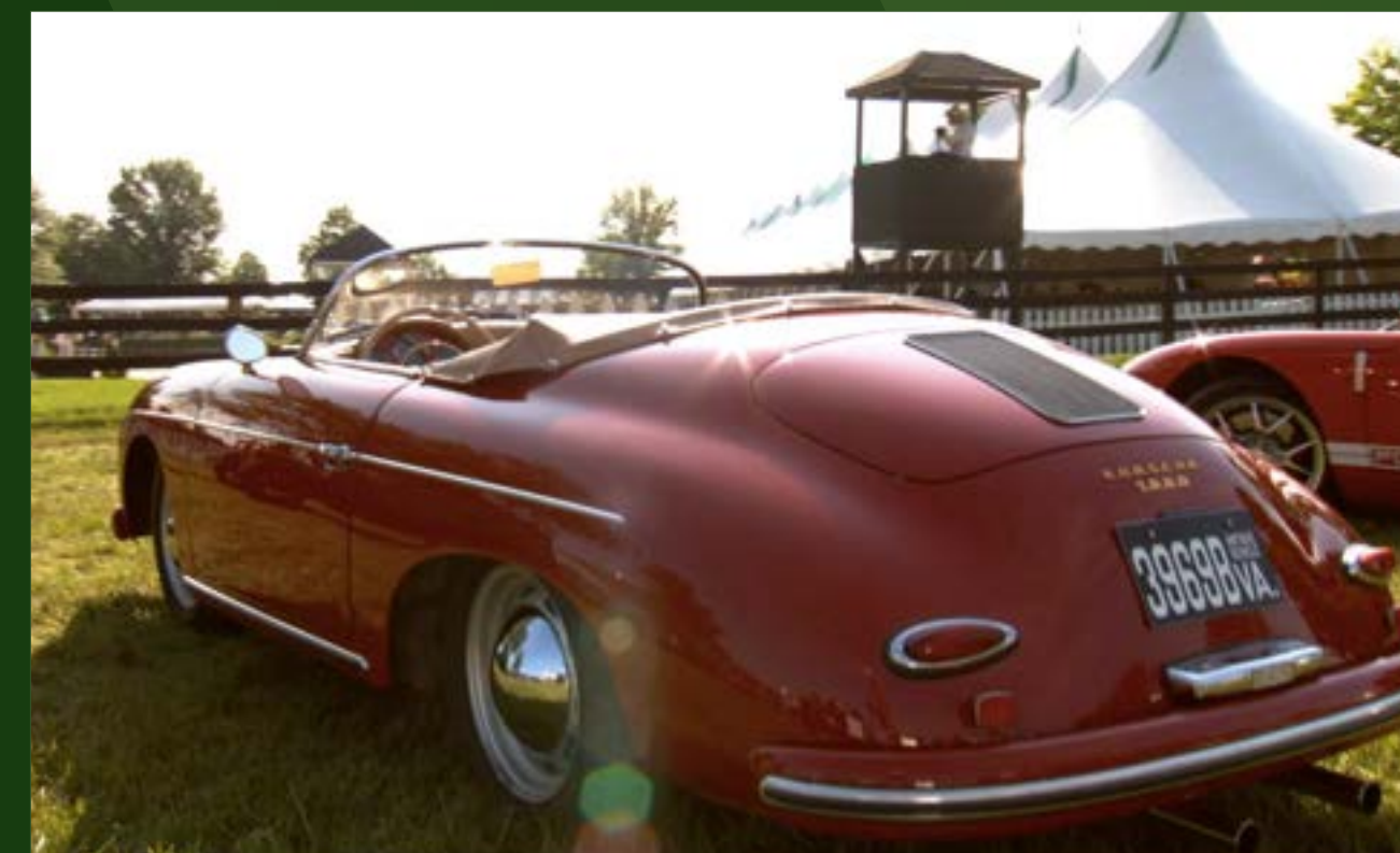
HORSES & HORSEPOWER