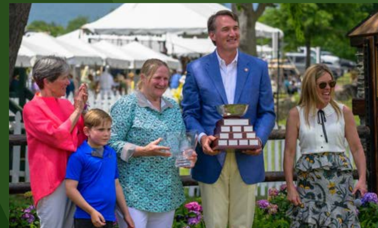
AWARDS & CEREMONIES