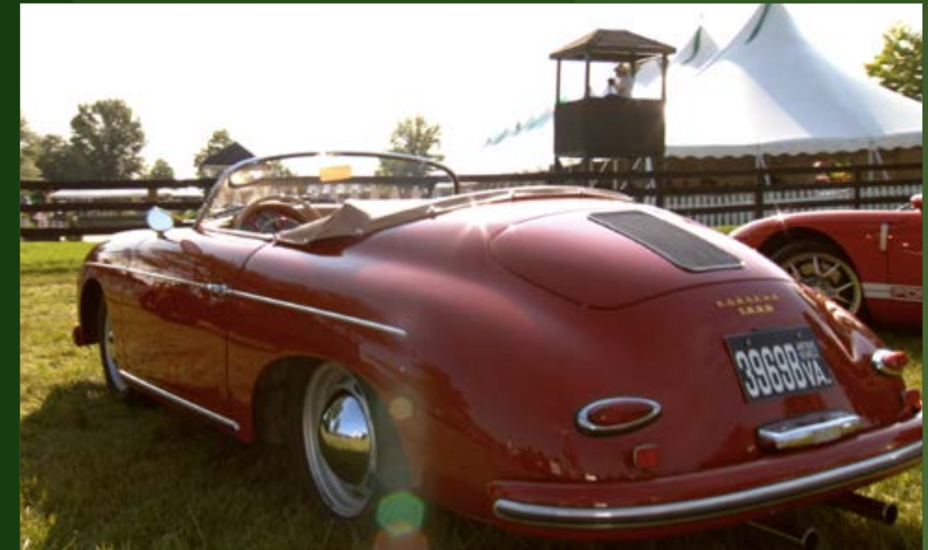
HORSES & HORSEPOWER