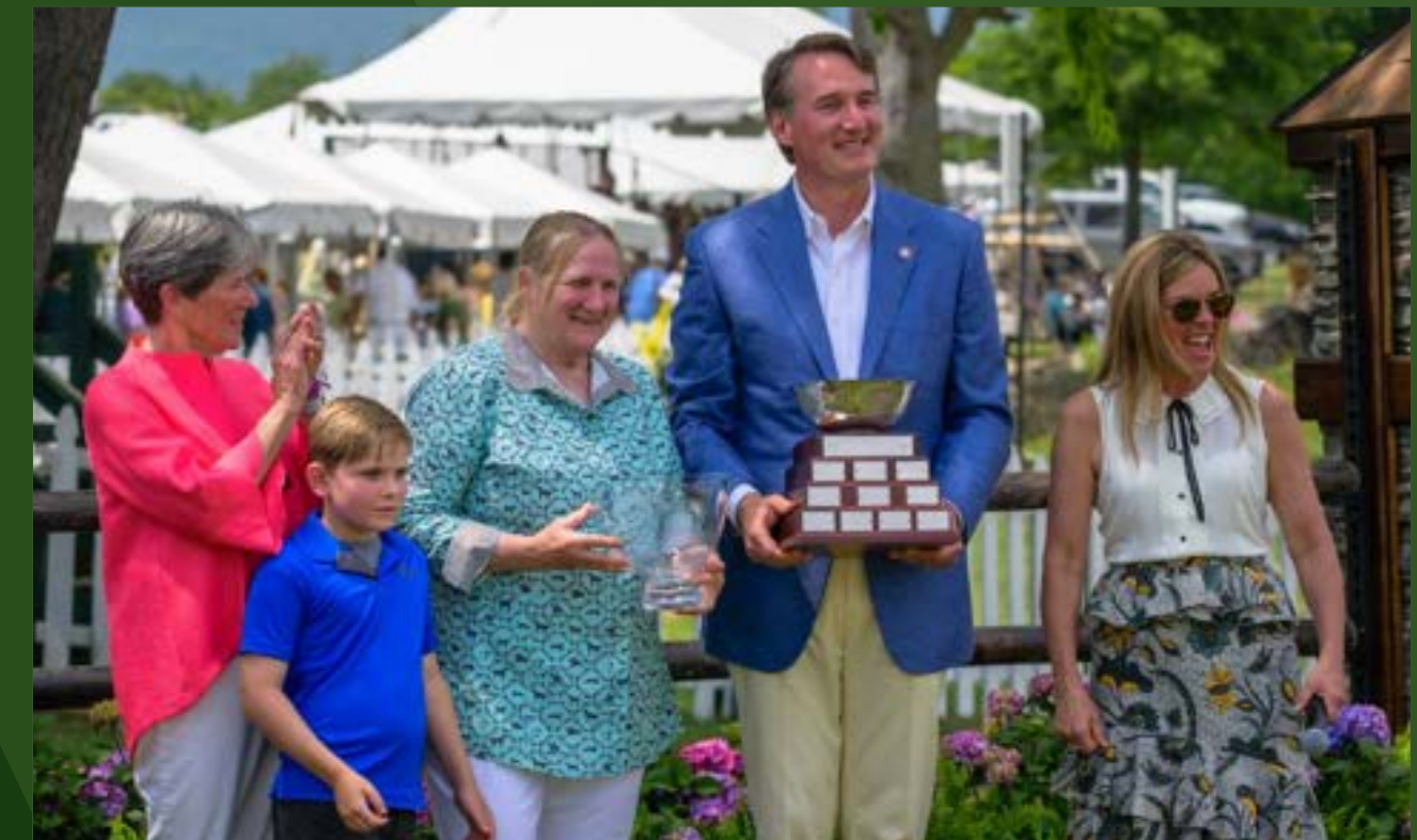
AWARDS & CEREMONIES